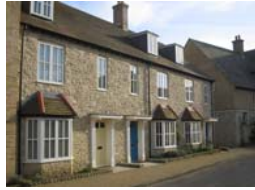
A significant volume of social rent, affordable and sheltered housing