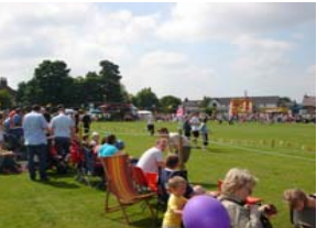
Mansefield Park increased area