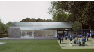
Improved access and extension to St Paul's Primary School