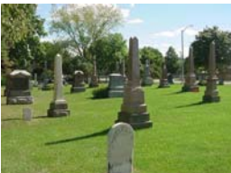
Land for new cemetery