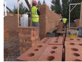
Calderwood will provide a range of new employment opportunities for local people and apprenticeship schemes will be initiated. In addition new business opportunities will be created at Camps and through out the development