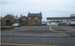
Extension to Local Health Centre and increased parking provision