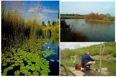
Proposals to remediate the existing water filled quarry, preserving wildlife habitat and creating a safe amenity