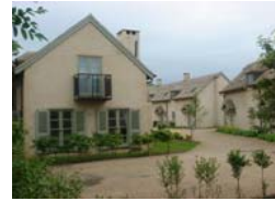
Greenlinks to Meadow Wood