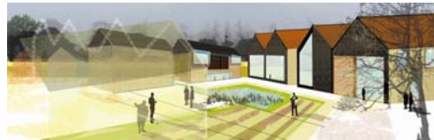
Existing buildings and local style