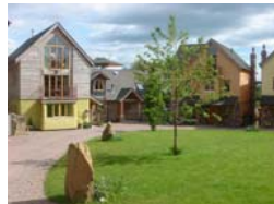
Environmentally friendly and in harmony with the landscape